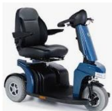
Max 160 Kg or 25 stone (16 Km/H)