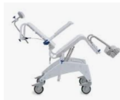
Type D (Max 130 Kg or 20 stone) Small wheels (stepless seat incline up to 45°)