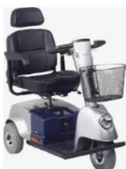
Max 125 Kg or 19 stone (8 Km/H)