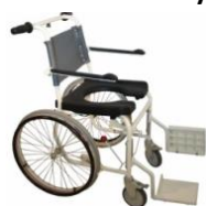
Type B (Max 130 Kg or 20 stone) Big wheels