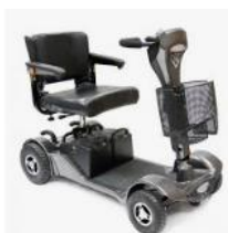
Max 110 Kg or 17 stone (6 Km/H):