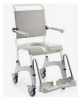
Type C (Max 130 Kg or 20 stone) Small wheels