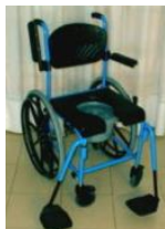
Type A (Max 100 Kg or 16 stone) Big or small wheels